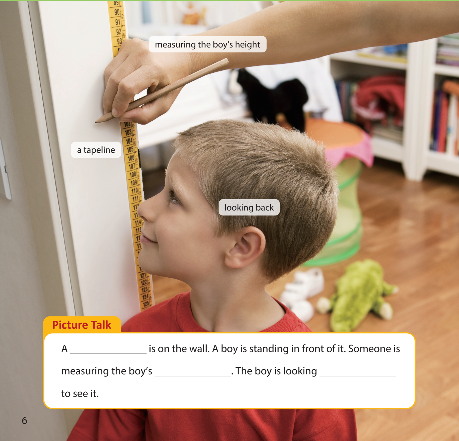
measuring the boy's height